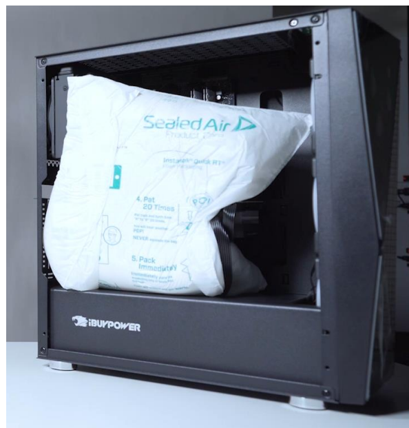
Figure 4 - Internal packing foam

If your PC has a high end or heavy graphics card, you may have a piece of expanding foam on the inside of the system to prevent damage during shipping. Make sure you check the inside of the case before powering on as you definitely don't want to power the system on with this foam in place.