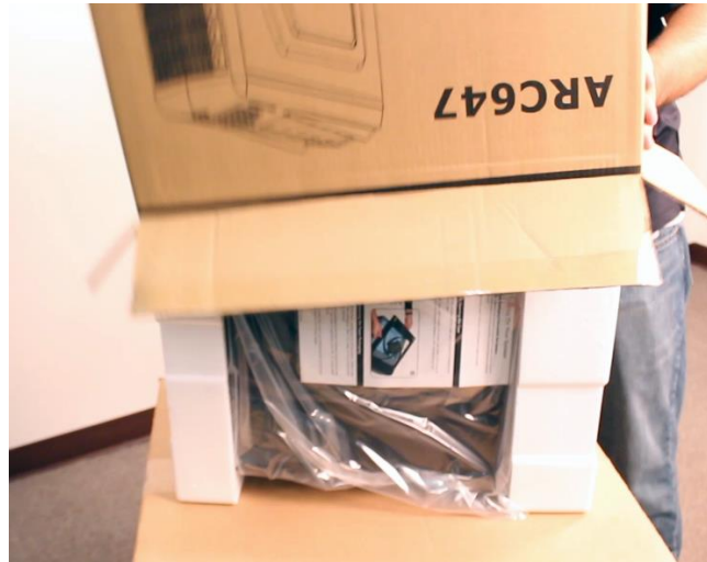
Figure 1 - Unbox upside down