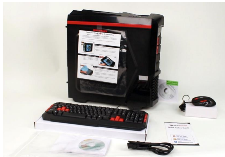
Figure 2 - System with accessories

Go through all the packaging to locate all the accessories that come with the PC