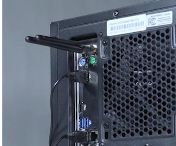
Figure 3 - Wi-Fi antennas